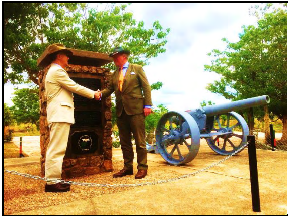
General Lord Richards shakes hands with Hans Casper Graf zu Rantzau

monument had been beautifully restored for the occasion by the Commonwealth War Graves Commission. Soldiers from 3rd Battalion the Zambia Regiment, from Kabwe provided the sentries around the monument, a colour party and two guards. Their standard of drill was of a high order and their steadiness throughout a long parade was most impressive. Their uniforms retained the bush hat, cap-badge and red, white and green hackle from the Northern Rhodesia Regiment 6 . The Band of the Zambia Regiment, in scarlet tunics, provided the music.