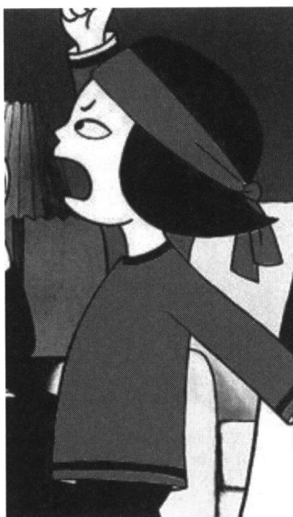
FIGURE 2. "Where Is My Vote?" by or in the style of Marjane Satrapi.